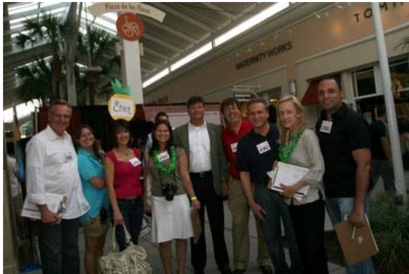
2009 Bacchus Bash Judges