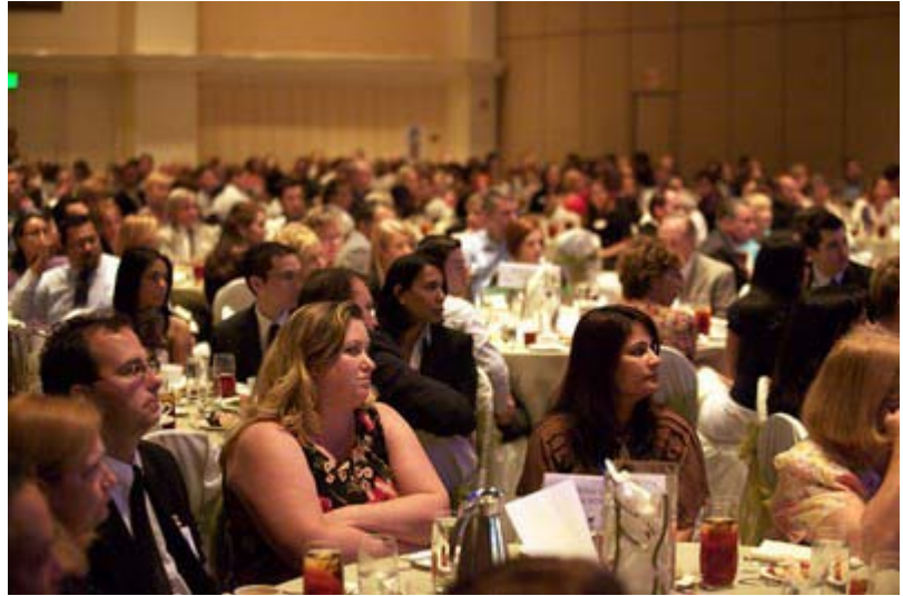
CFHLA Members and guests pack the room at Buena Vista Palace Hotel & Spa

During this luncheon, $50,000 in scholarships and grants were awarded to local hospitality students. Also, the "CFHLA Cares" Program conducted a 'Collection Drive' benefiting Homeless Students in Orange and Osceola Counties.