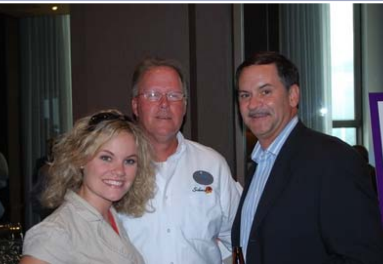
Allied Members networking with Lodging Leaders.