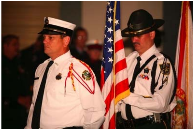
The Central Florida Fire and Police Honor Guard respectfully presented our colors.