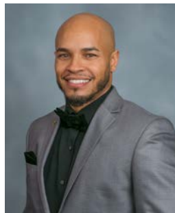
Les Harris Hilton Garden Inn Lake Buena Vista/Orlando