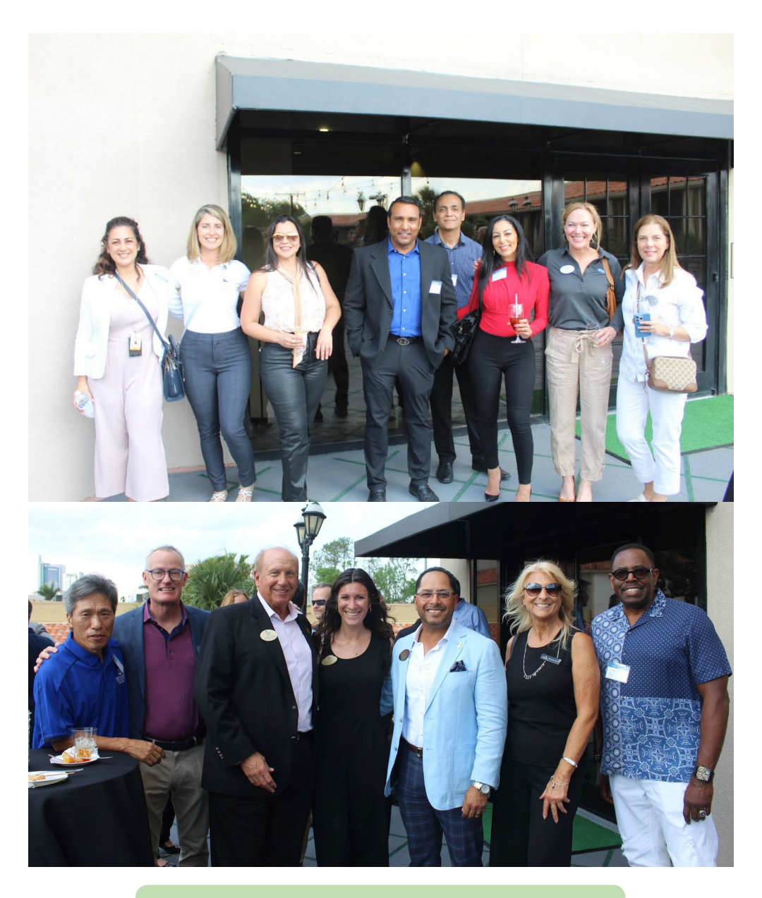
Click Here to View Photos from the New Member Reception