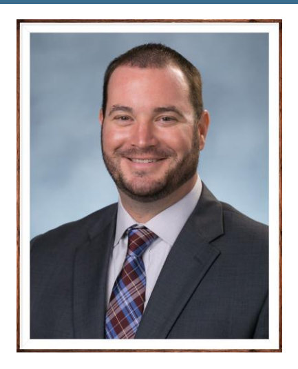
Crown Linen LLC