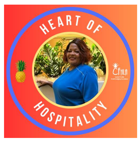
Sylvia Tobie Hotel Kinetic Orlando Universal Blvd.