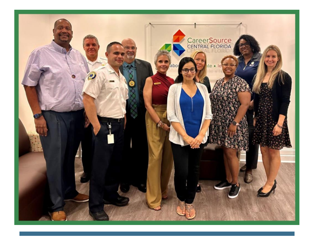
Reserve Your Spot Today to Attend Our Upcoming Patriot Day Remembrance Breakfast