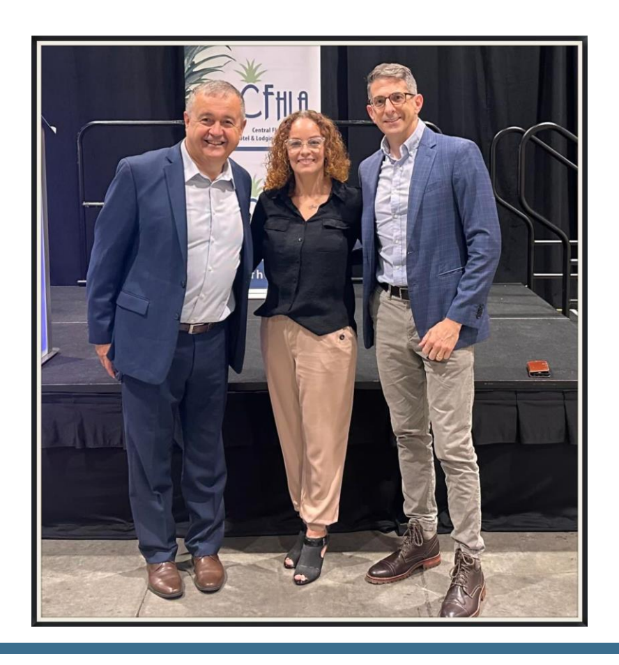
Register for Upcoming Active Assailant Training