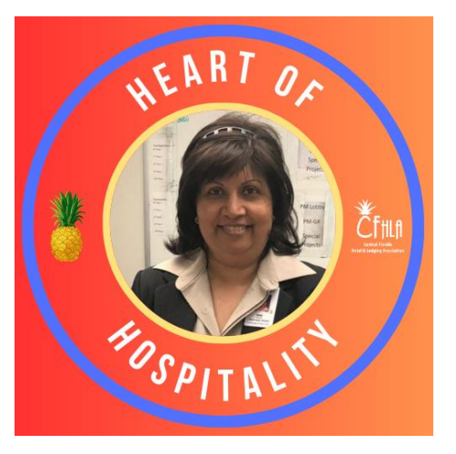
Bibi Rahaman Hyatt Regency Orlando International Airport

CONGRATULATIONS TO OUR SEPTEMBER MEMBERS OF THE MONTH