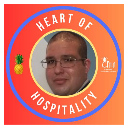
Santos Diaz Hampton Inn and Suites Orlando East/UCF