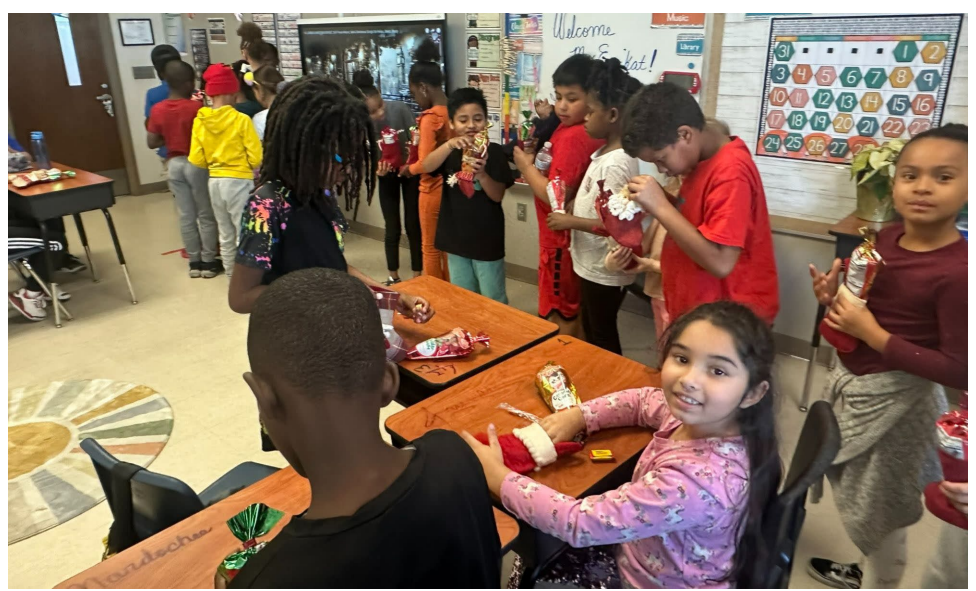
Thank you Hilton Grand Vacations for your support of the CFHLA Adopt-A-School Program and for helping to make a positive impact within our community!