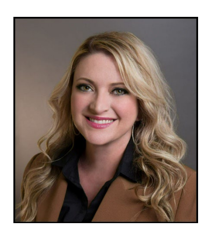
Norah White I-Drive District