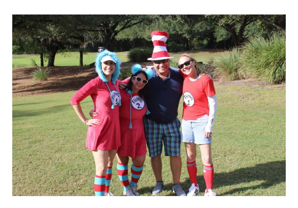
Best Decorated Hole / Best Costume PCPI Services, Inc.