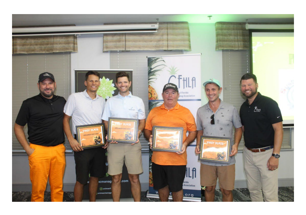
Second Place Team <u>Legacy Vacation Rentals</u>