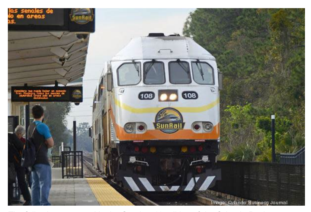
The following appeared in the October 10 edition of the Orlando Business Journal

On October 10, Orange County unanimously approved the creation of a special taxing district called the Shingle Creek Transit & Utility Community Development District from <u>Universal Orlando Resort</u> that will help fund the proposed Sunshine Corridor for passenger trains to connect to <u>International Drive</u> and <u>Orlando International Airport</u>.